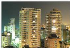
XR4i with Night Blur Control