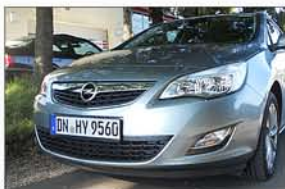
High resolution 700 TV lines