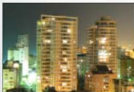
Normal standard camera