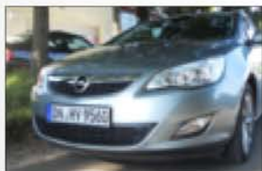
Standard resolution 420 TV lines