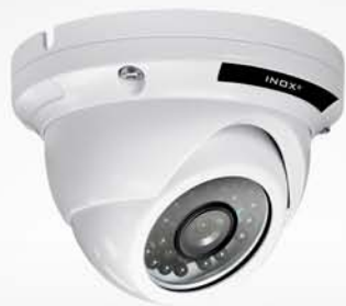
Support Wall & Ceiling mount installations